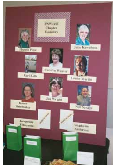
A display at the 10th Anniversary meeting introduced the PNW chapter founding members.